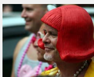
2009 Southern Decadence at St. Ann and Bourbon Streets