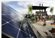
Green Music Festival