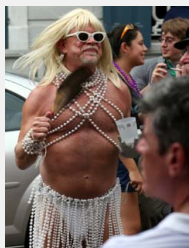
2009 Southern Decadence at St. Ann and Bourbon Streets