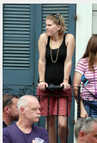
2009 Southern Decadence at St. Ann and Bourbon Streets