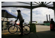
Green Music Festival