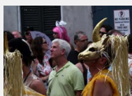
2009 Southern Decadence at St. Ann and Bourbon Streets