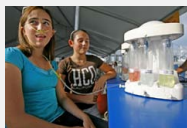
Green Music Festival