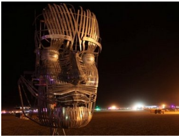
Enlarge